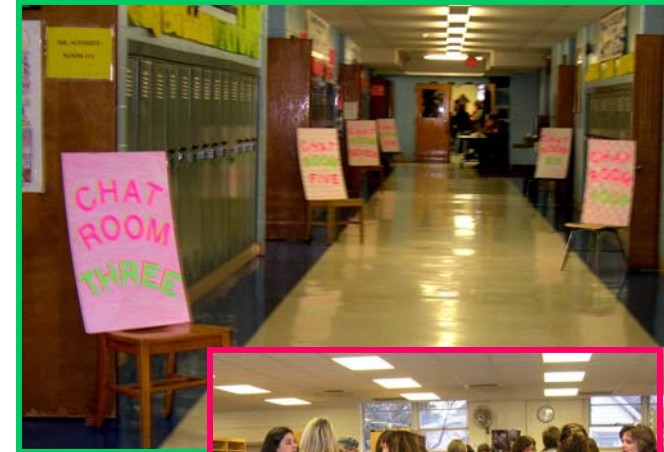
Chick Chat '09 served 175 fourth– through sixth-grade girls while the accompanying Mom Chat offered their mothers inspiration and advice.