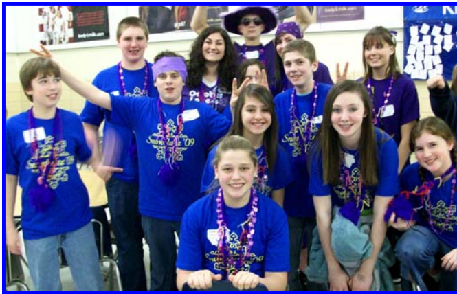
HGNA co-sponsored Snowflake for the first time in 2009.